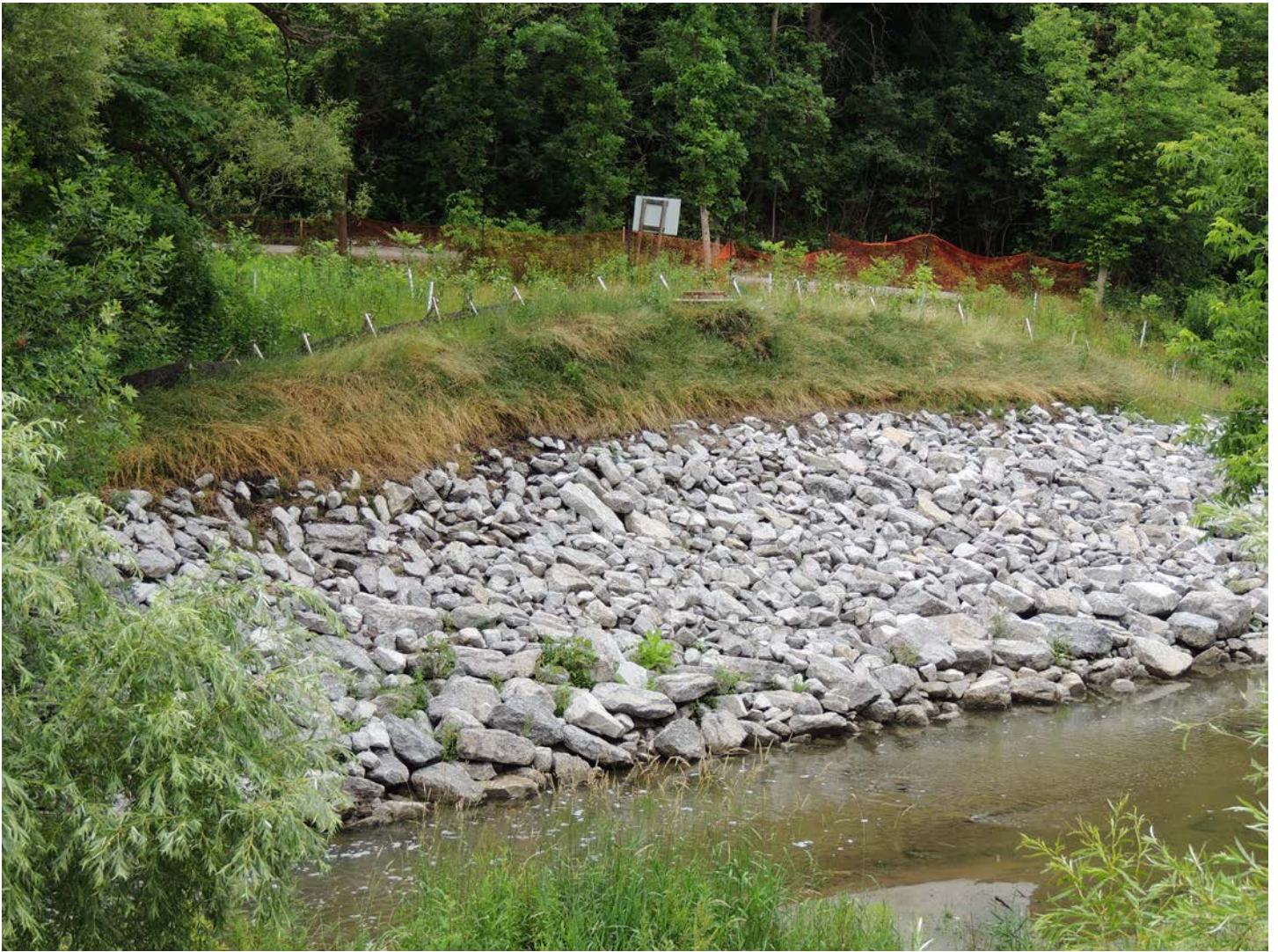
Figure 2. Vegetated stone revetment at Site P-531.