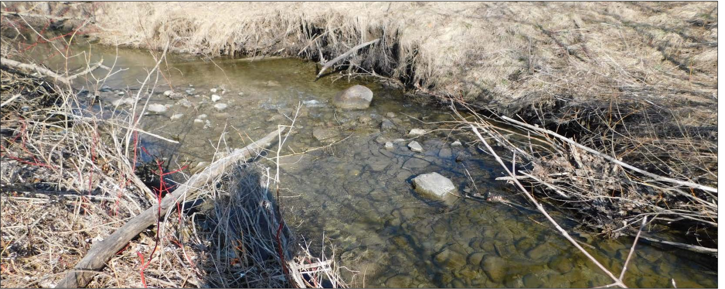
Figure 3. Current conditions at Site I-070.