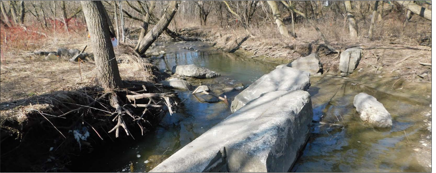
Figure 2. Current conditions at Site P-107.