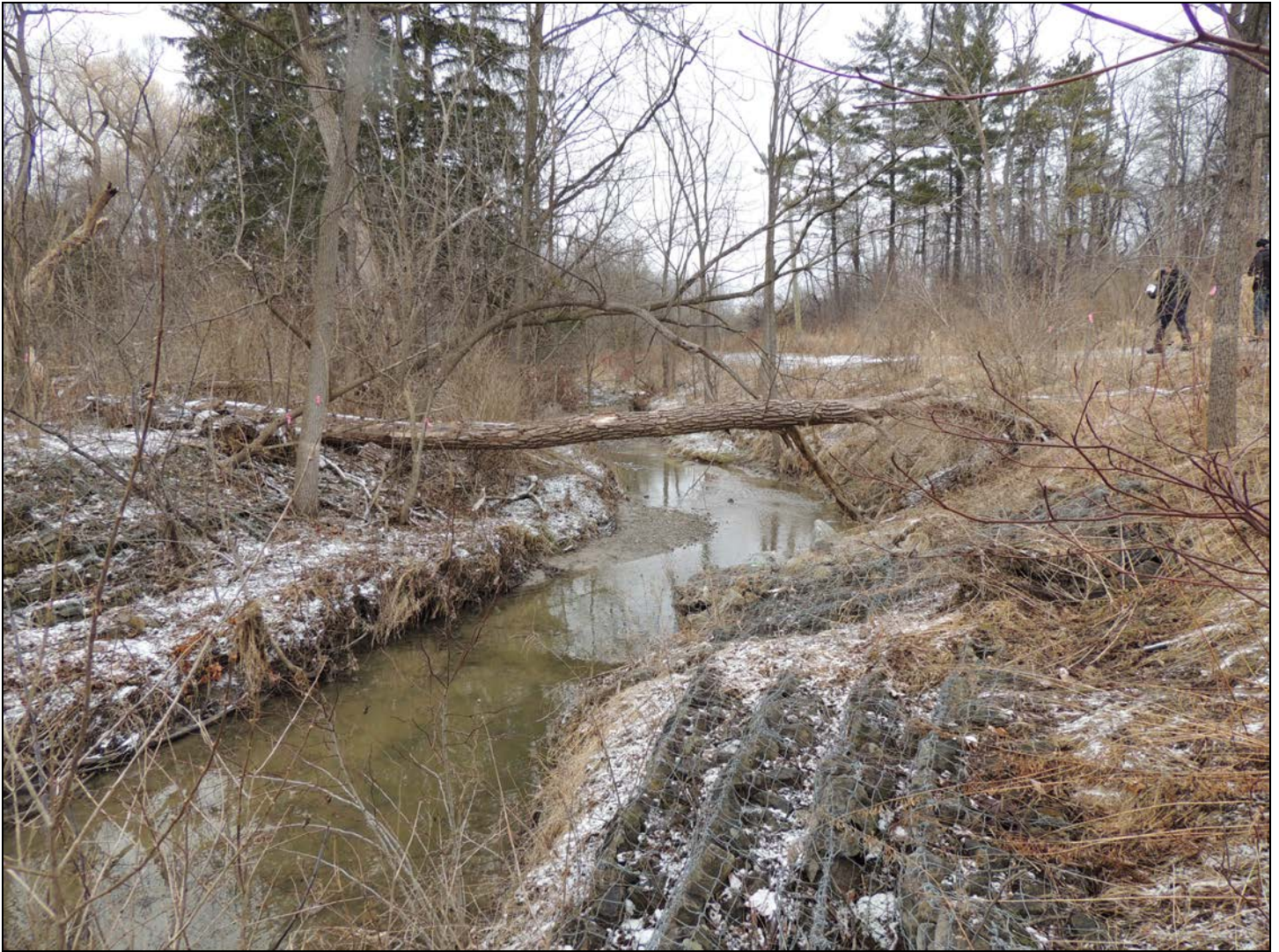
Figure 2. Current conditions at Site P-080 with view of pre-existing gabion baskets on the east bank.