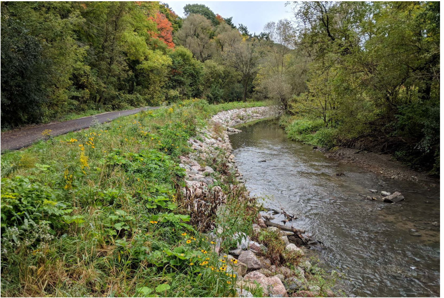
Figure 2. Round stone revetment at Site P-057.