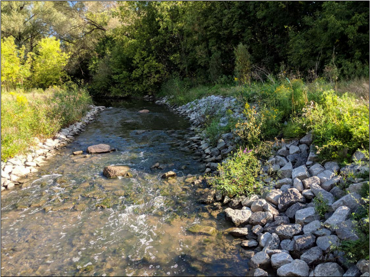
Figure 2. Riffle bed protection at Site I-365.