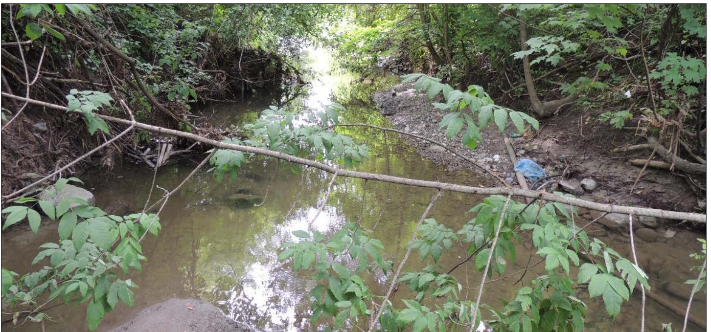
Figure 3. Current conditions at Site P-079.