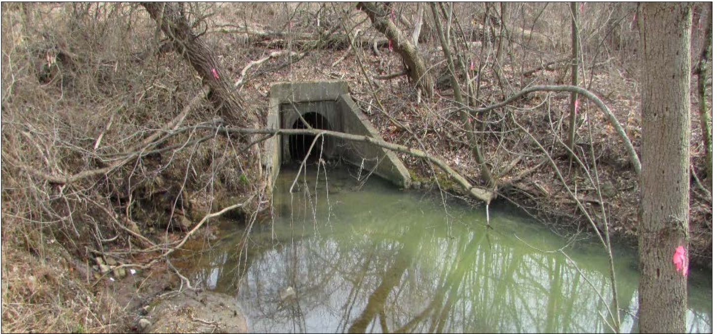
Figure 2. Current conditions at Site I-335 with view of existing stormwater outfall.