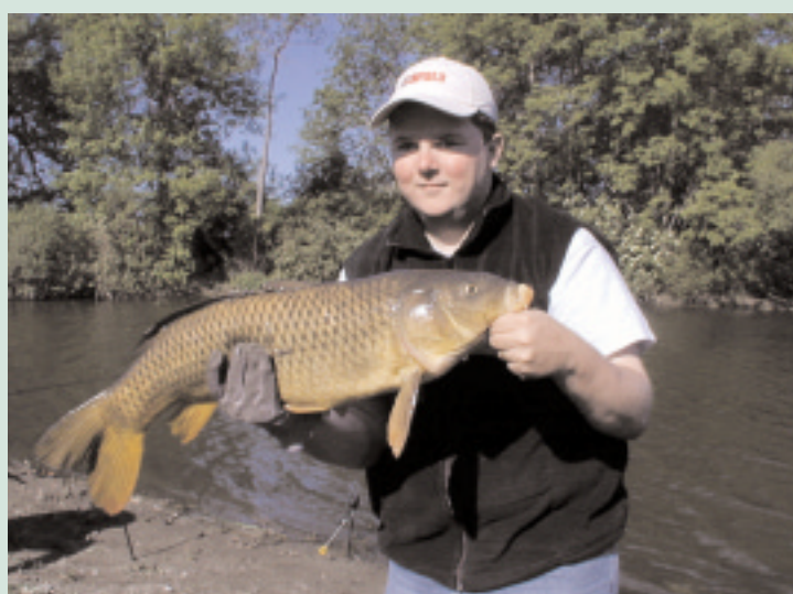
A typical carp that can be caught from The Islands