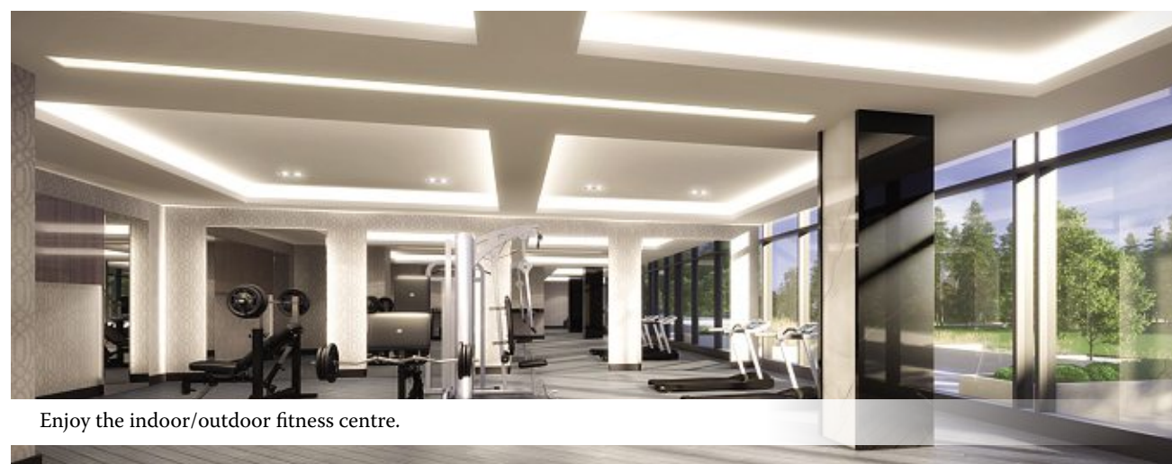
Enjoy the indoor/outdoor fitness centre.

All the suites and townhomes will be graced with Pemberton's high-quality features and finishes. These include, all as per plan, include 5"-wide laminate flooring, smooth-finished ceilings throughout, 9-foot ceiling heights in principal rooms, kitchens with under-cabinet lighting and a stainless steel appliance package, spa-like bathrooms(s), and a balcony, terrace or patio.