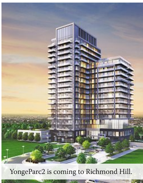
YongeParc2 is coming to Richmond Hill.

Call 905.553.1430 or visit pembertongroup.com