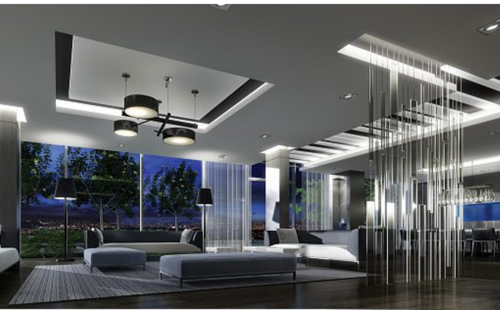
The 17,000 square-feet of amenities include the sophisticated party room.

To learn more about Pemberton's many fine condominium communities and those coming soon, visit pembertongroup.com . You can also follow the company on Facebook, Twitter, Instagram and YouTube.