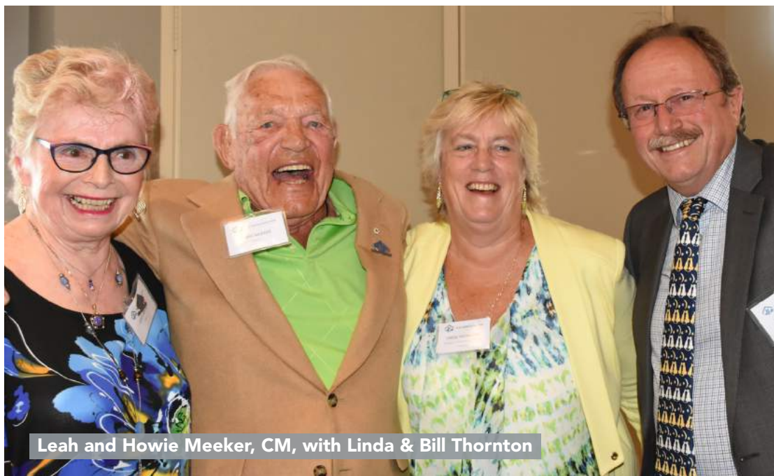
Leah and Howie Meeker, CM, with Linda & Bill Thornton